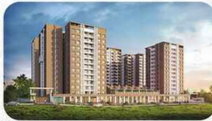
Phase - 01 Development