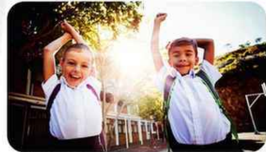
Gatha Waldorf School

Biodiversity revival in 70 acres of barren land