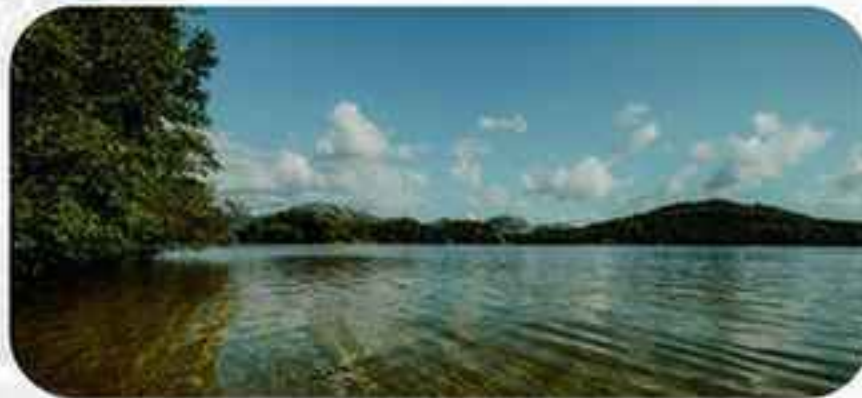
On the banks of Indrayani River

Evogreen City seamlessly integrates beautiful elements of nature such as the serene Indrayani river that flows within the project and the mystical Gatha Bio-diversity Park that hosts over 2 lakh trees with multiple species of thriving flora and fauna.